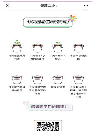
Using QR code for inviting the students joining online activities