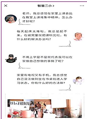
Summarizing the questions of the students related to those disruptions on their daily schedule and learning habits, under the pandemic