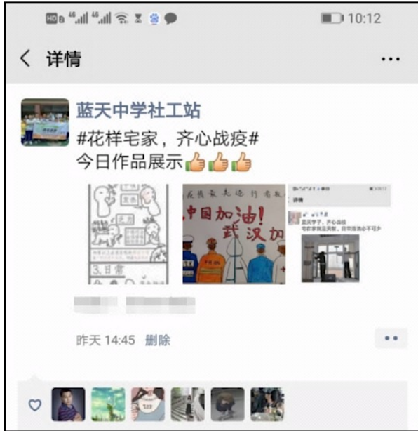
Sharing the students' pictures drawn at home for cheering up with one another via Wechat