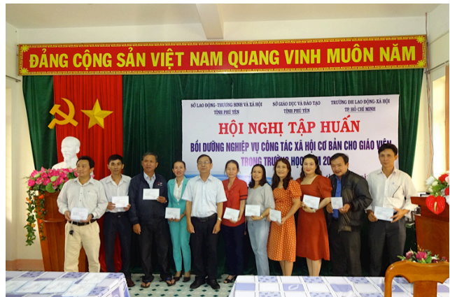
Training course on school social work for teachers in 2020

On January 22, 2021 the Prime Minister signed Decision No. 112/QĐ-TTg to issue the Plan of Social Work Development for the period 2021- 2030 in which the government focuses on social work in schools, hospitals, prisons, rehabilitation centers for drug abusers and in the justice system. The universities and colleges have already designed their curricula for School Social Work at the BSW and MSW levels. So far, there are approximately 70 institutions offering social work education in Vietnam and the evolution of school social work is progressing.